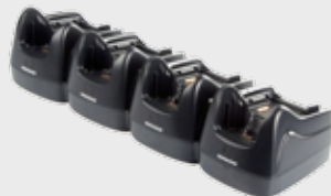
• 94A150037 4-Slot Charging Dock • 94A150038 4-Slot Ethernet Dock