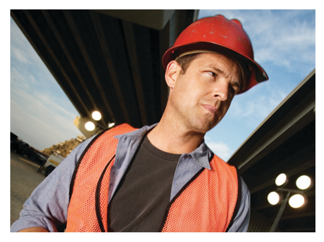
Its rugged design and FIPS 140-2 certification enable state, local and federal governments to leverage the MC75A to improve operational efficiency and better protect revenues ' and constituents.